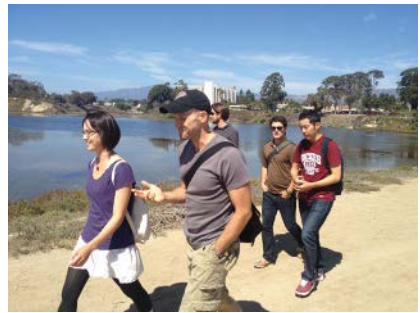
PEPP students get to know one another while walking around the lagoon on campus.

eral forums for bringing the diverse range of people together to work collaboratively and share their own research. A recent addition is the campus Center for Social Solutions to Environmental Problems (CSSEP). The Center brings togeth-