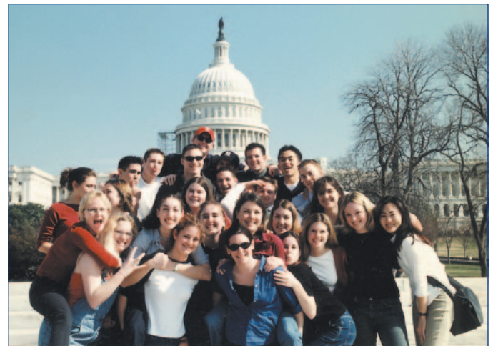
UCDC STUDENTS, WINTER QUARTER 2000