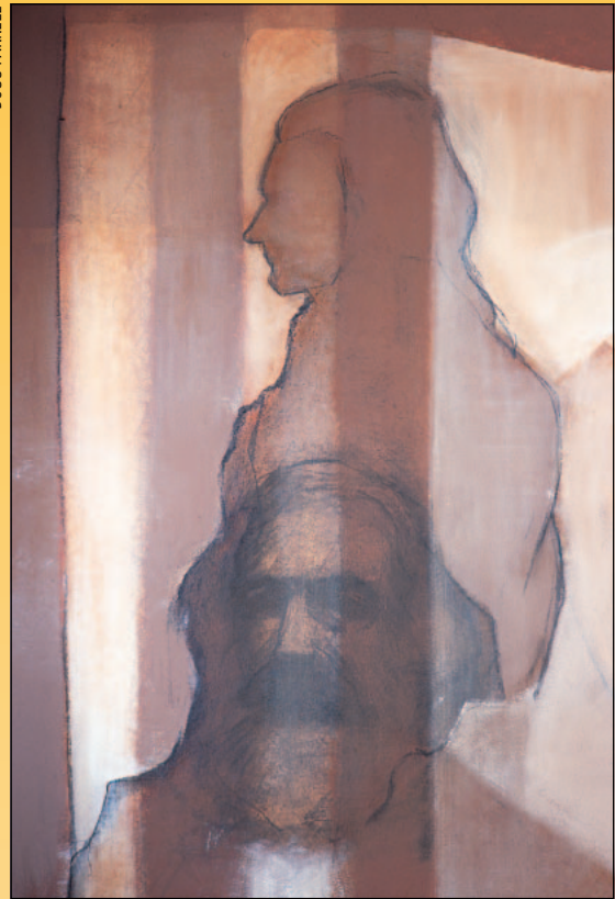
JEFFERSON AND MARX: DETAIL FROM LANE ROOM MURAL.