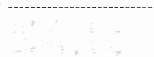
The foreign-exchange reserves of the ASEAN + 3 nations at the start of 2010, according to Bloomberg.